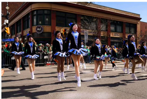
Dancers with the Harris-Grieco Academy Of Irish Dance perform during the St. Patrick's Day Parade in Buffalo on Sunday, March 17, 2024.